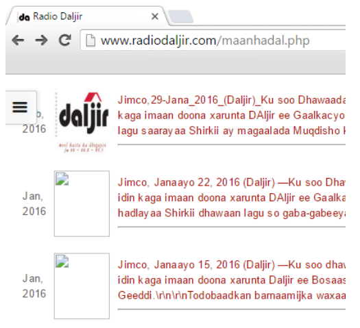
Broken links, poor user experience

During our review of the website's Google Analytics data and other performance reports we found that, because audio programs were playing as MP3 files served directly from the website, they were